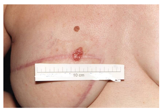
Figure I Recurrent nodule in the latissimus dorsi reconstruction scar.

The differential diagnosis was between that of Paget's disease of the breast (although there was no underlying breast tissue or nipple and it was not seen in the original