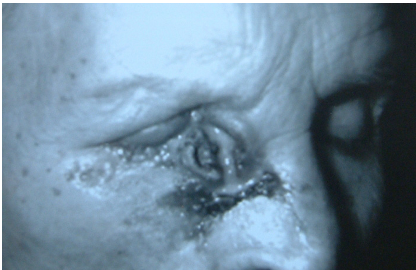
Figure 1 Giant BCC located on the inner canthus

commonly appear on the trunk and display a more aggressive behavior, resulting in local invasion and metastasis. The reported incidence of metastatic BCC ranges from 0.03 % to 0.55 [5]. We report a case of simultaneous lung and parotid gland metastases of giant BCC located on medial canthus.