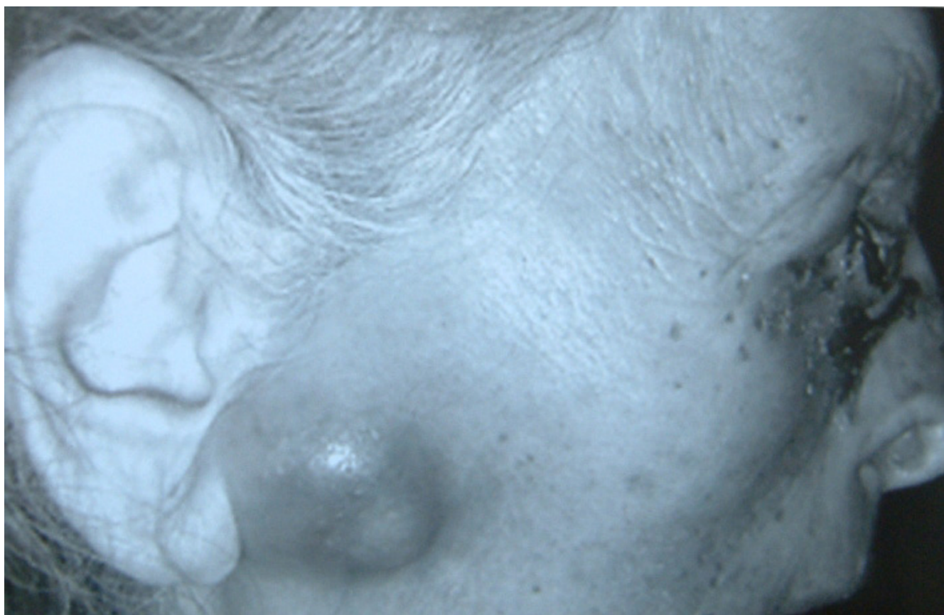
Figure 2 Involvement of the parotid gland of the patient

Examinations of the cardiovascular, gastrointestinal, neurological, urogenital and hematological systems and other parts of the skin were performed by physical and routine laboratory and radiological techniques. There were no abnormal findings. Biopsy was performed from the tumor located on the inner canthus and revealed "adenoid basal cell carcinoma" (Figure 4). Also, Fine needle biopsies were performed on the parotid and pulmonary lesions which confirmed the presence of adenoid BCC in these regions.