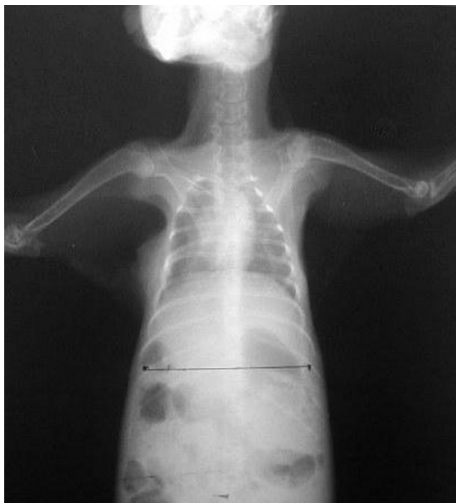
Figure 2 Postoperative 7 th day chest radiograph of a rabbit of control group.

groups received single dose prophylactic antibiotic, and received diclofenac sodium for postoperative analgesia for 3 days.