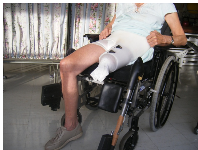
Figure 4 Clinical appearance of Case Patient 2 months following operation. Case Patient was able to sit upright comfortably with brace and was able to ambulate independently with crutches.

Wide resection remains an important principle in the treatment of bone and soft tissue sarcomas. Despite the fact that the majority of patients with pelvic sarcomas can be safely treated with chemotherapy and limb-salvage surgery, [2] in a number of patients external hemipelvectomy is still required to achieve wide margins. Techniques used for soft tissue coverage following external hemipelvectomy include the posterior flap and the anterior flap closure [3,4]. These techniques aim to achieve tissue coverage but is often associated with high morbidity and poor functional outcomes [5,6]. Post operatively the majority of patients are either unable to ambulate without the use of crutches (80%) or remaining wheelchair bound or bed bound (15%); only around 5% of patients are eventually able to ambulate with prosthesis [7]. Well-fitted prosthesis for post-external hemipelvectomy patients is difficult to produce and the energy requirement to ambulate with prosthesis is very high. For patients who had external hemipelvectomy even the ability to sit upright can be difficult without a well-fitted sitting socket because of the lack of an ischium. Psychological issues surrounding body image following external hemipelvectomy is also significant and requires extensive pre and pos operative counseling [8].