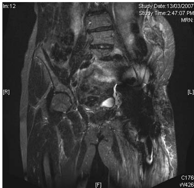
Figure 1 Pre-Operative MRI coronal view of Case Patient showing local cancer recurrence involving left pelvis and surrounding the saddle prosthesis.

From posterior, the medial origin of the gluteus maximus was elevated from the sacrum. An osteotomy was performed through sacrum from the greater sciatic notch laterally to approximately 1 cm medial to the sacroiliac joint. Ileo-lumbar, sacro-tuberal and sacro-spinal ligaments are divided. Under external rotation of the hemipelvis, the hemipelvis, tumour mass and femur were delivered en-bloc .